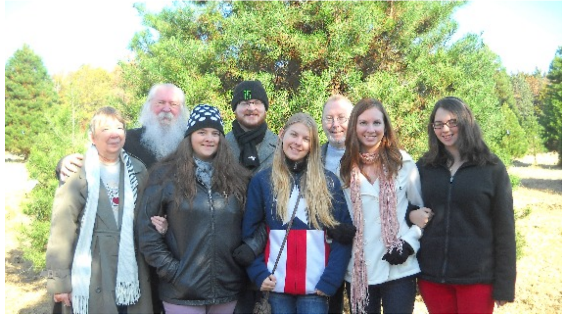
Annual Christmas Tree Farm Visit