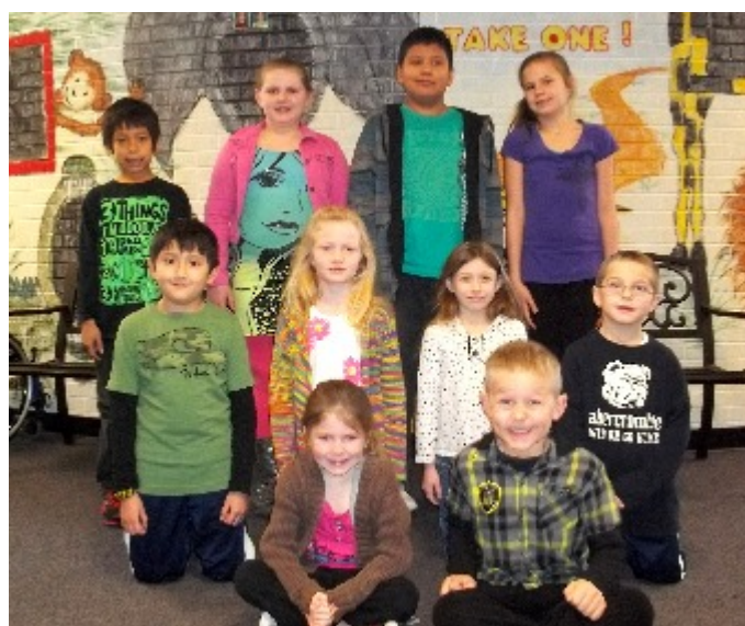
November Students of the Month