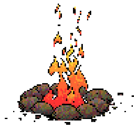
Home Heating in Past