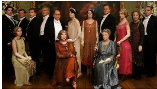
Downton Abbey Poetry