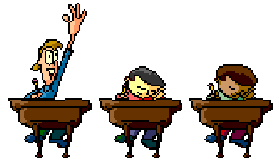
Howe Honor Rolls