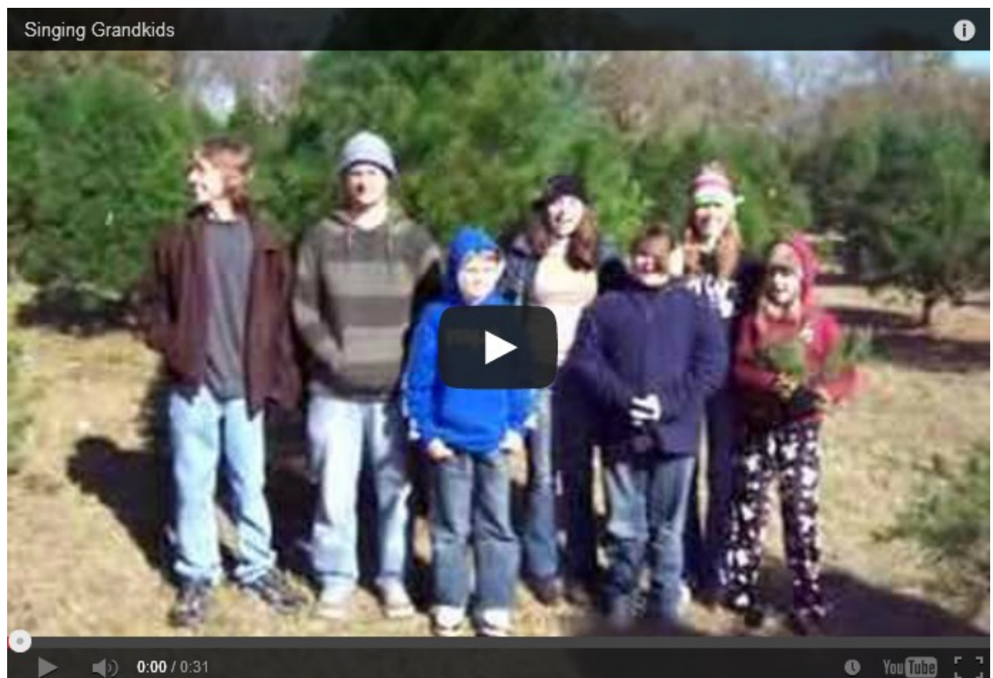
Grandkids singing at the Elves Christmas Tree Farm, 2007