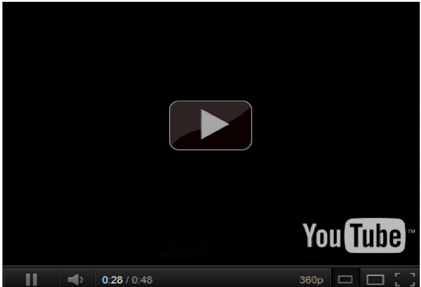
Grandkids singing at the Elves Christmas Tree Farm, 2007