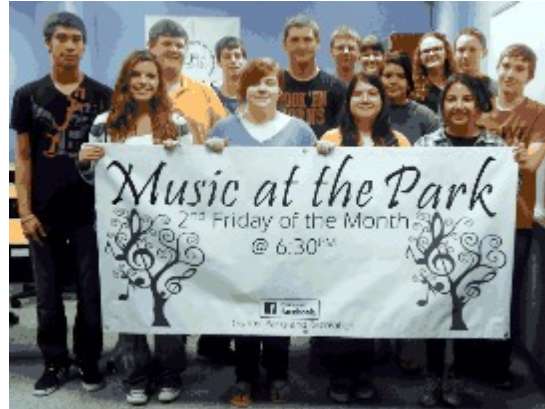
Bulldog Graphics Design